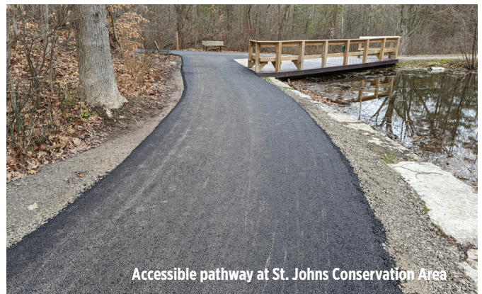
Accessible pathway at St. Johns Conservation Area

In 2022, Niagara Peninsula Conservation secured $750,000 in federal funding to improve green space and accessibility at six conservation areas: Ball's Falls, Binbrook, Cave Springs, St. Johns, Louth and Rockway. There is much more to do. You can make it happen.